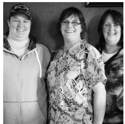
Workers at the Carefree Living assisted living facility in Minnesota recently voted to join the UFCW

including Maryland-based Asbury Communities, already have begun putting this advice into practice.