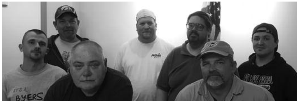
Workers at a Hormel Foods warehouse in Iowa recently ratified a new contract.

"I'm proud of our negotiating committee for standing firm on the